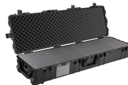
1770WF With Foam